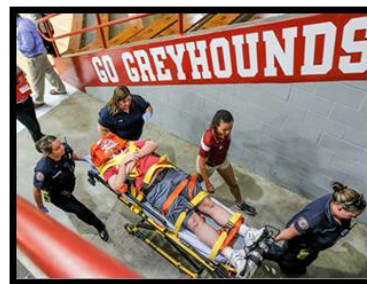
Injured player is transported off field