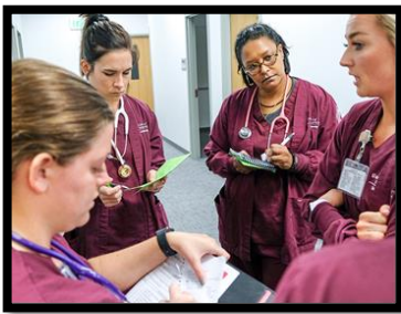
Students prepare for simulation