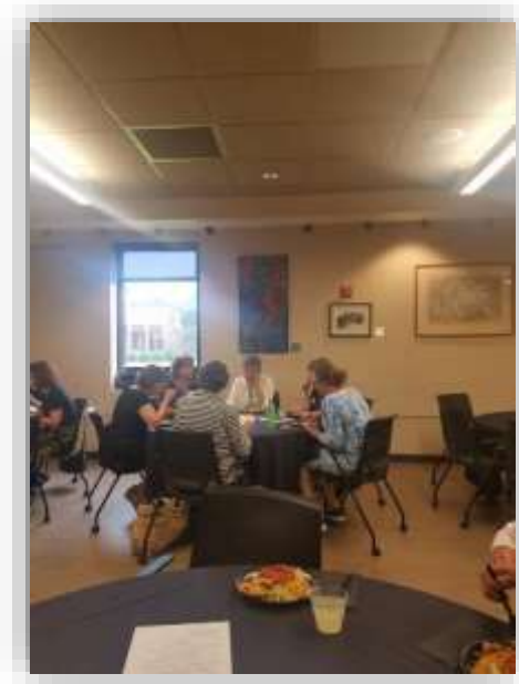
Above: Attendees enjoy a meal before the panel