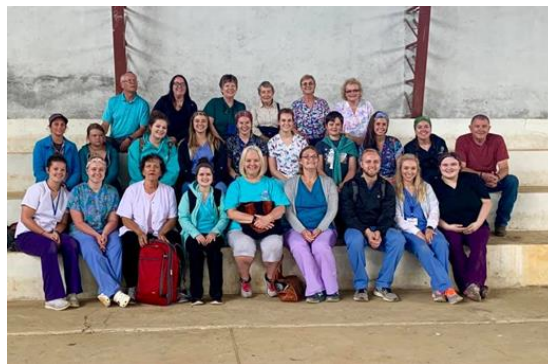
UIndy's Ecuador team

Overall, this trip was amazing. To be able to touch the lives of so many patients and families is heartwarming. Students were able to practice their skills in the clinic setting, experience a different culture, and work as a cohesive team to provide care to the people of Ecuador. Doctors and nurse practitioners were able to lay their healing hands on patients of all ages, treating problems and providing care. Missionaries were able to connect to people and spread the word of the Lord. Every single person on this Spring Term trip had an experience of a lifetime and left knowing they touched many lives in Ecuador.